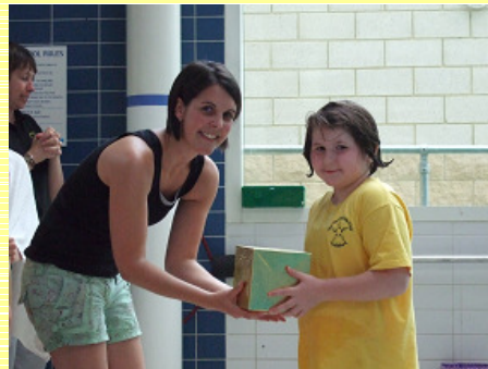
Under 9 winner