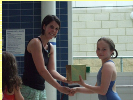
Under 12 winner