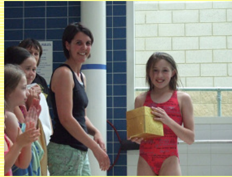
Under 14 winner