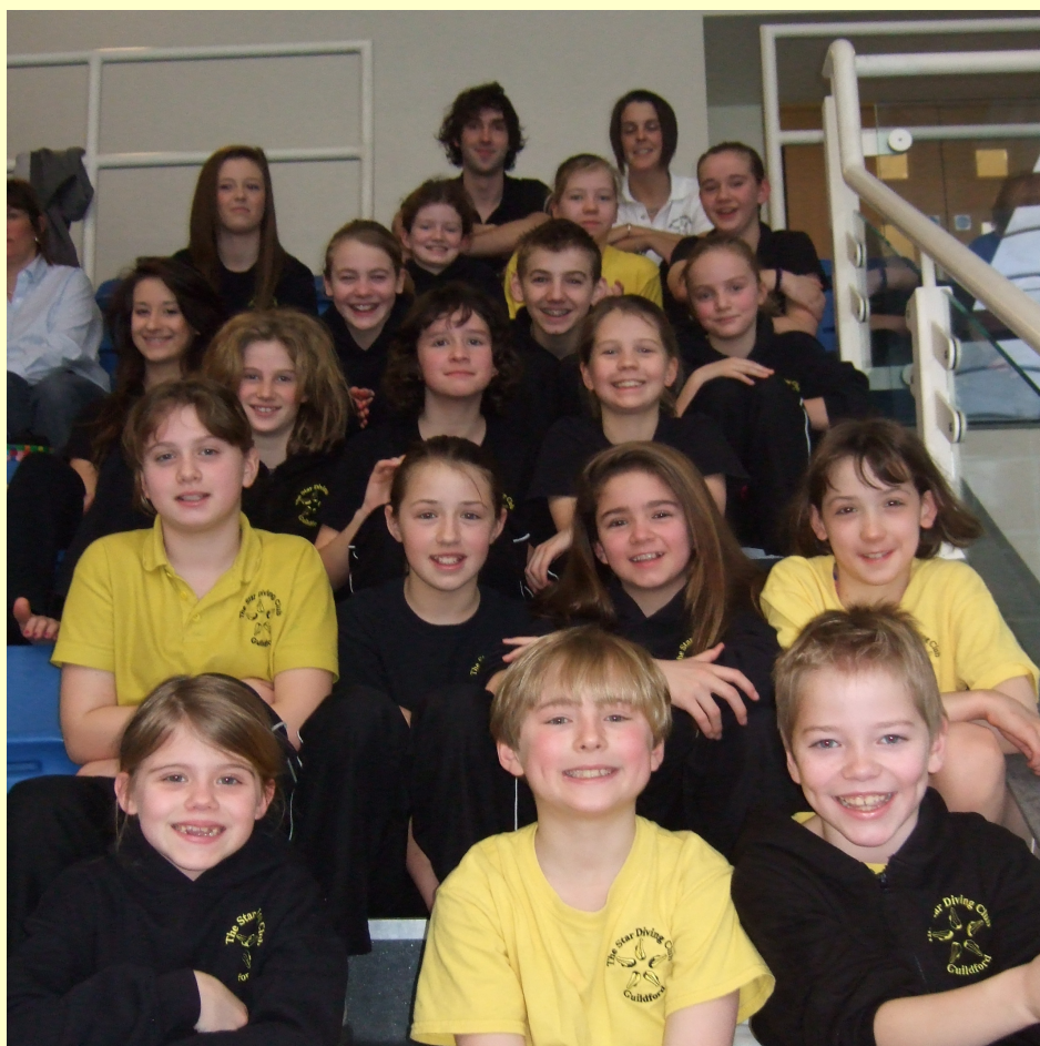
The Star Diving Club Team at the ASA South East Region Competition

You should, by now, have received your subscription renewal forms. Please note that they are due back by 3rd April. Prompt payment is always hugely appreciated!