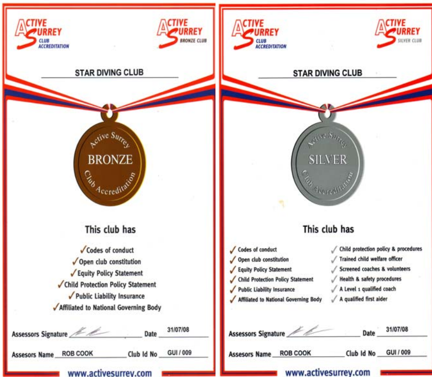
The Active Surrey bronze and silver accreditation certificates awarded to the club in July

STAR had been accredited in July by local sports body Active Surrey at bronze and silver levels.